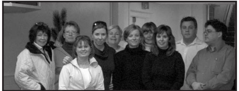
Some members of the 2007 MHJA Board of Directors

"The Derby" EC sanctioned show (presently sponsored by Westgates/Horse & Co.), is the signature